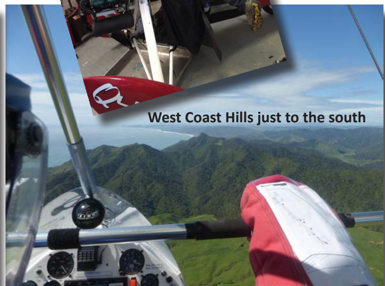
West Coast Hills just to the south