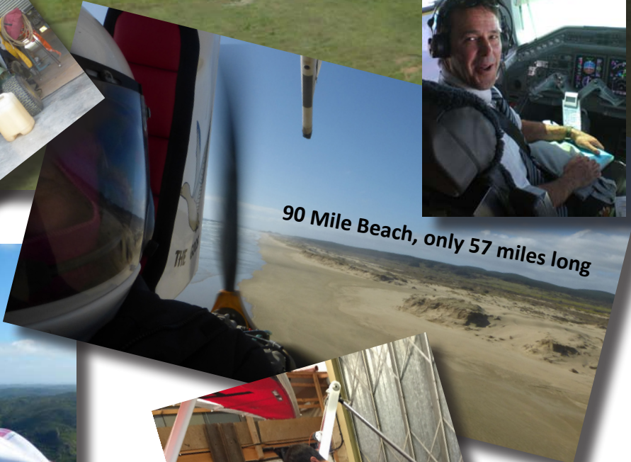
90 Mile Beach, only 57 miles long