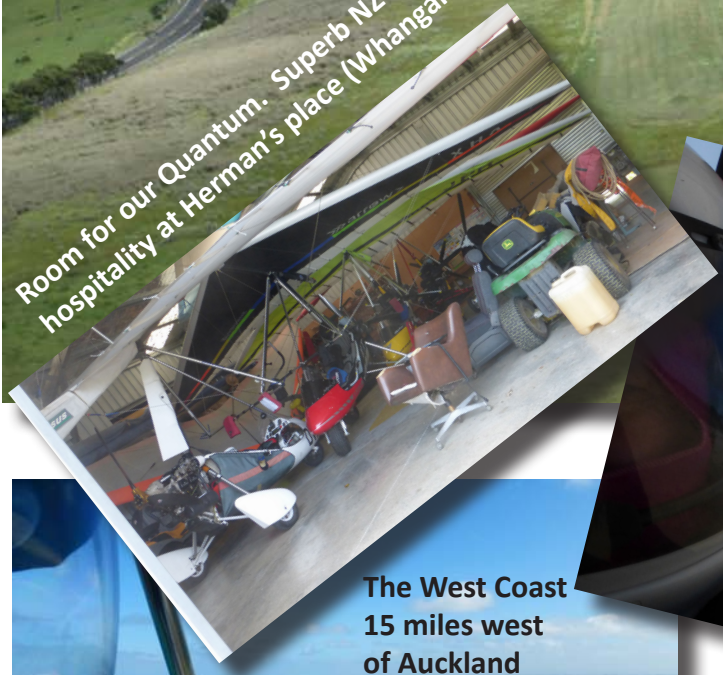
Room for our Quantum. Superb NZ hospitality at Herman's place (Whangarei)