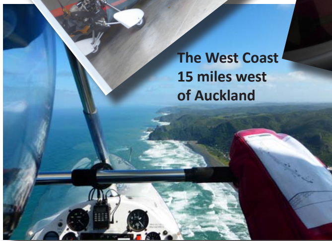
The West Coast 15 miles west of Auckland